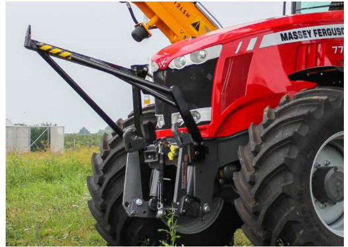
Work tool carrier at the front of the mounting frame. The boom rests on it in the transport position.