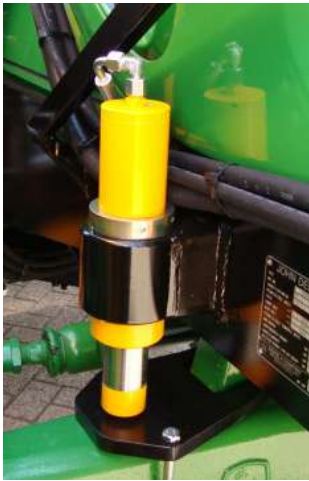
Front axle stabilisation is no luxury, but a real necessity. On the left a fixed front axle and on the right a suspended front axle.