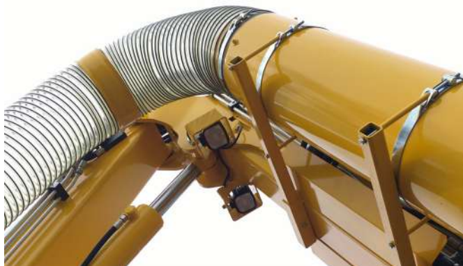
Optionally two LED inspection lamp can mounted on the top of the second boom.

Herder has been building customised machines for more than 70 years. Machines which seamlessly match the needs and requirements of our clients. Let us tell you about the possibilities of having your Grenadier custom designed and built.