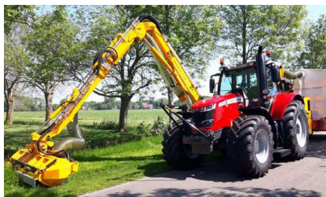
The boom and work tools can optionally be positioned rearwards for transport.