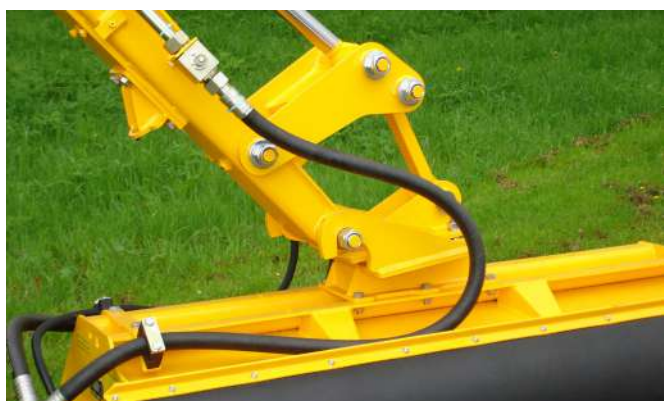
If desired, the bucket cylinder can be made with a tumbler which increases the tipping angle.