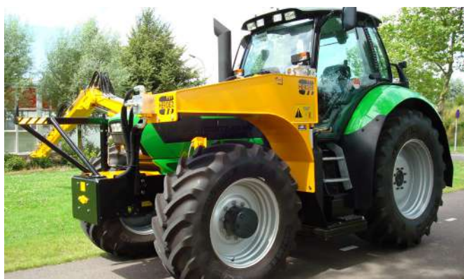
Example of the so called "Fixed mounting". The pumps are connected to the front PTO and the hydraulic tank is placed above the left front wheel. In this model, the back lifting device and PTO remain available, for example for a side flail mower.