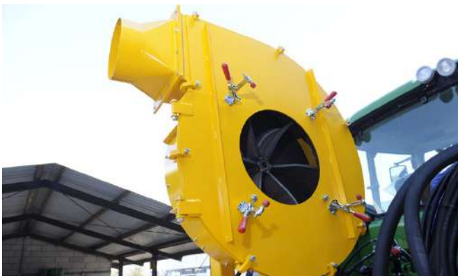
Quick connection of the hose to the impeller housing; impeller with vanes curved backwards.