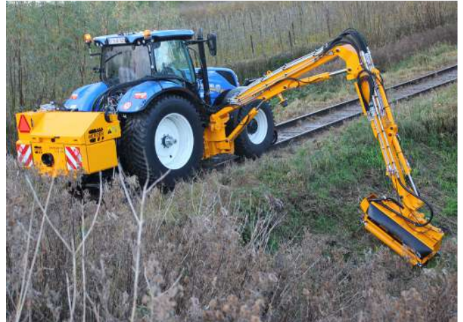
Grenadier with ecomower (KMU).