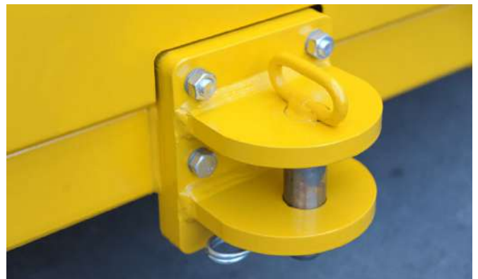
Heavy-duty tow bar for attaching a dump cart.