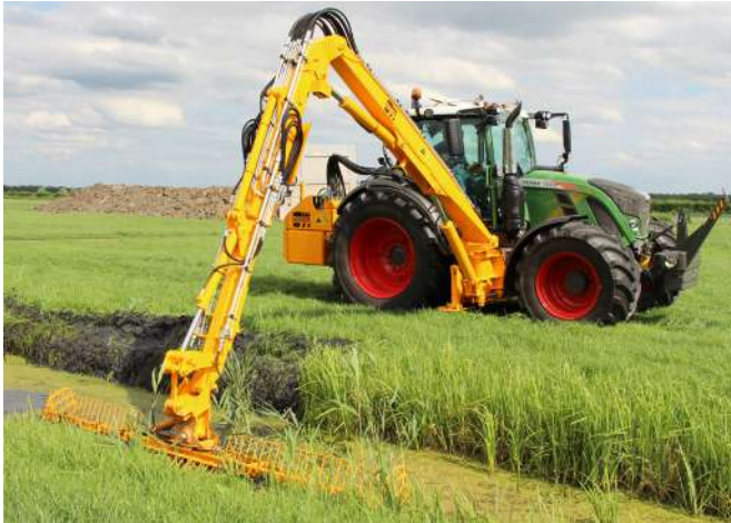
Grenadier with mowing bucket.