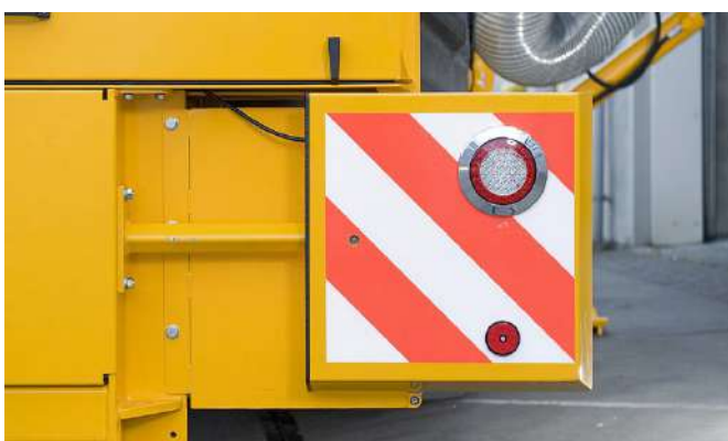
The marking signs with LED lighting can be extended to satisfy road traffic legislation if the width norm is exceeded.