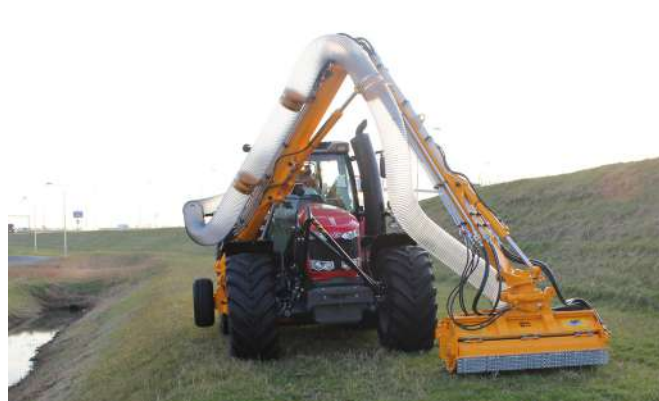
The Grenadier MBK513 has a pivot with 15° extra rotation range to the left, a sliding boom and a sliding tube as an alternative to the suction hose.