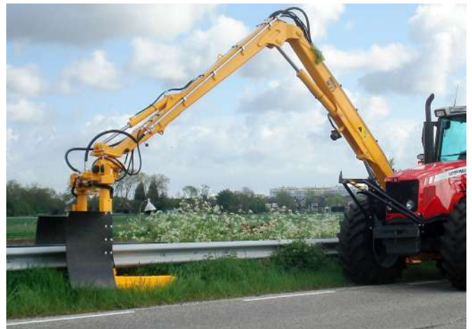
Grenadier with guard rail mower.