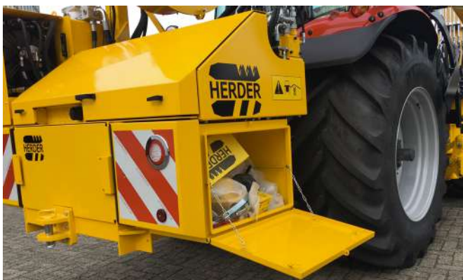
Hydraulic unit with safety markings, LED working lamp and a big tool box mounted in the lifting device of the tractor.