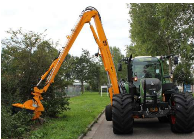
Grenadier with stump cutter.