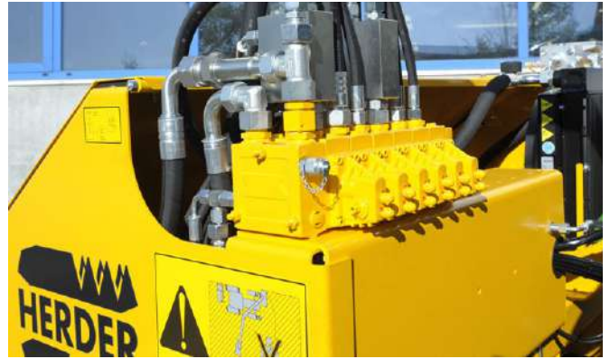
The hydraulic switching valves and control valves are carefully selected and meet the highest standards.