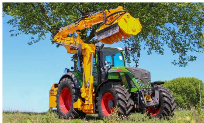
Grenadier in the 4-boom Pro execution. This execution has a transport position below 4 meter with free visibility for the driver.