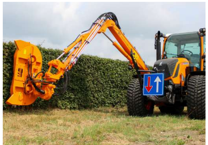
Grenadier with rotary hedge mower.