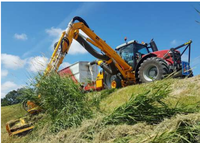
Grenadier with suction unit and ecomower (KMU).