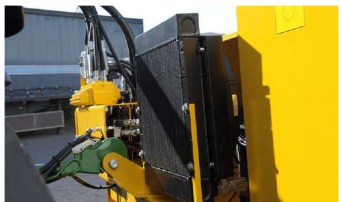
The Grenadier is equipped as standard with a 13.2 kW oil cooler to prevent temperature peaks and fluctuations.