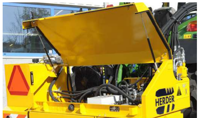
Tailgate with gas pressure springs for good access to the hydraulic components.