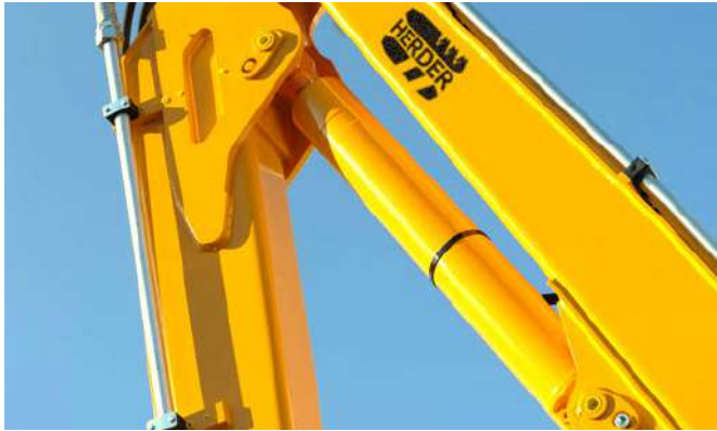
Herder develops and produces the cylinders so they can work faster and maintain their strength.

The Grenadier comes as standard with several items that allow you to work without any problems. And these extras are free of charge.